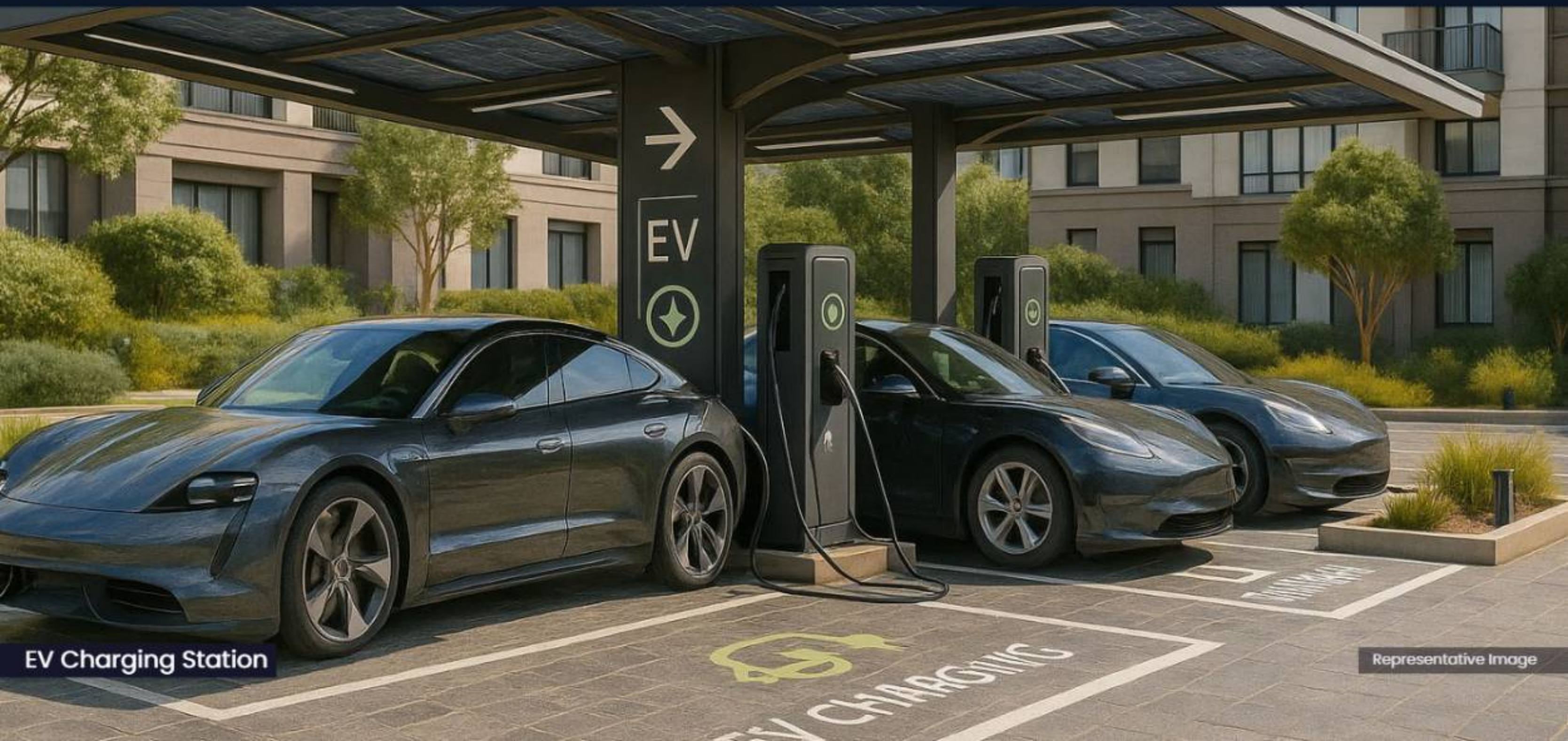
EV Charging Station

READY FOR THE NEXT GENERATION OF Sustainable MOBILITY.