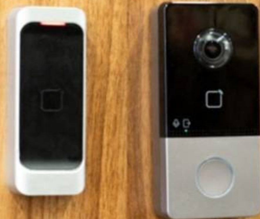
Video Door Phone