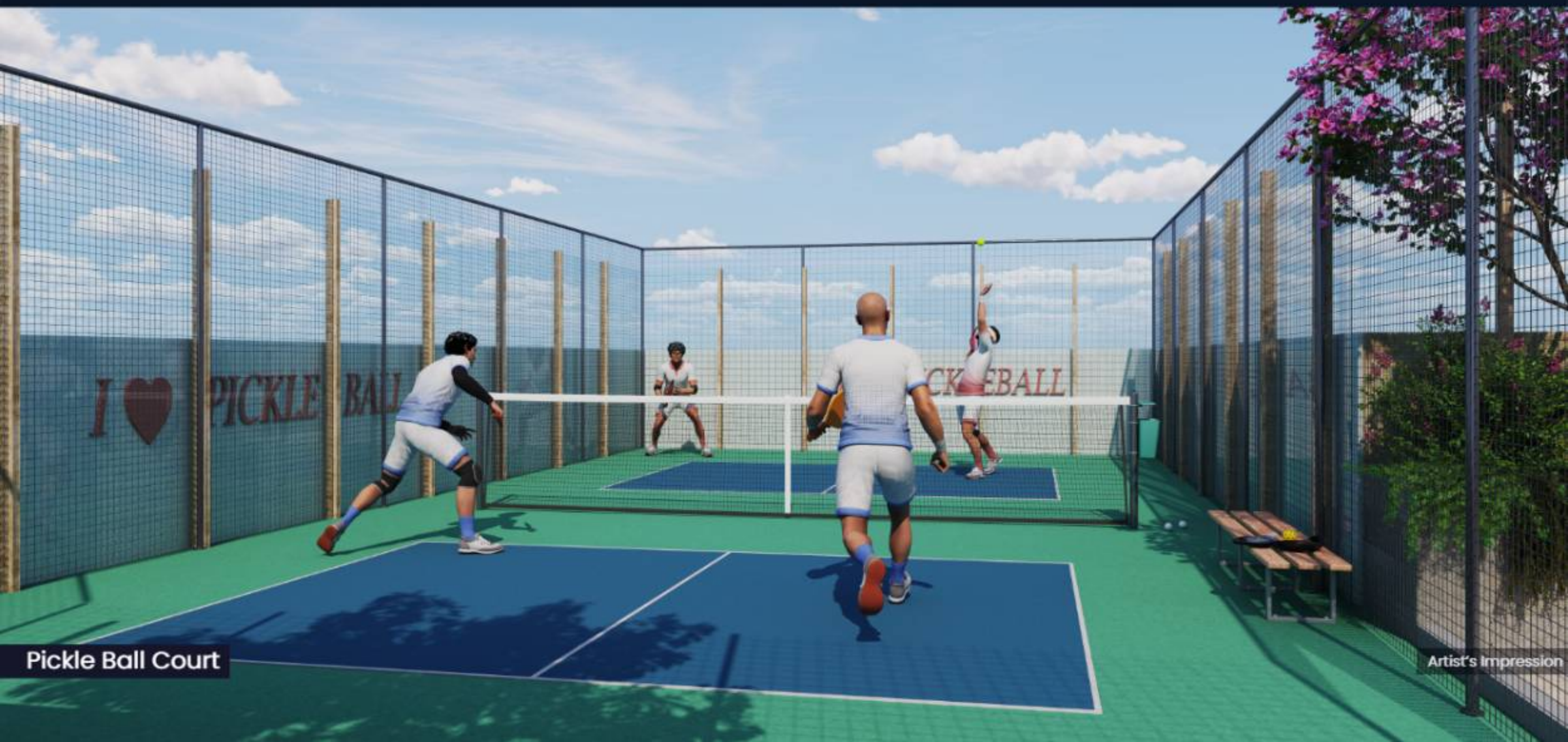
Pickle Ball Court