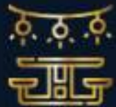
Alfresco Party Lounge