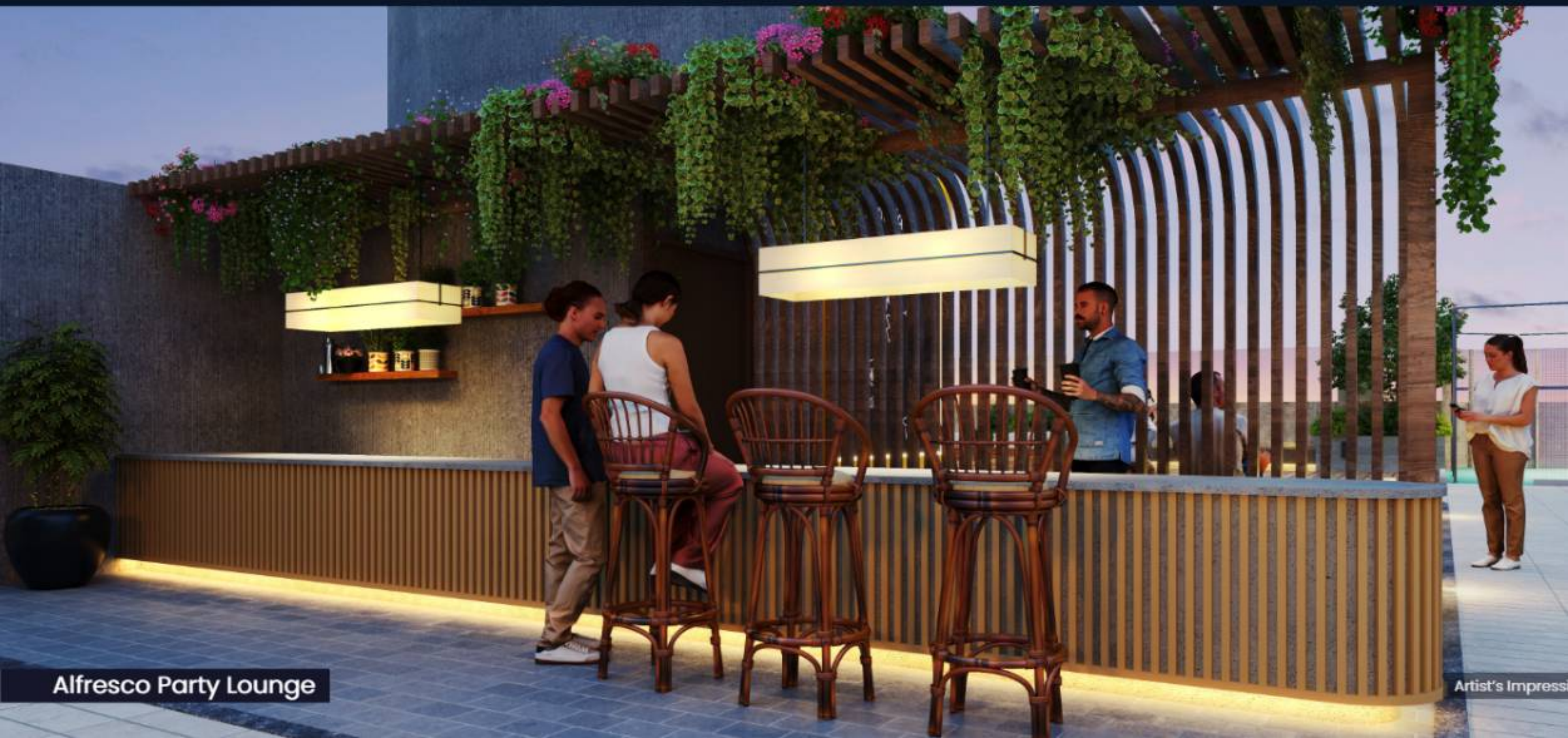
Alfresco Party Lounge