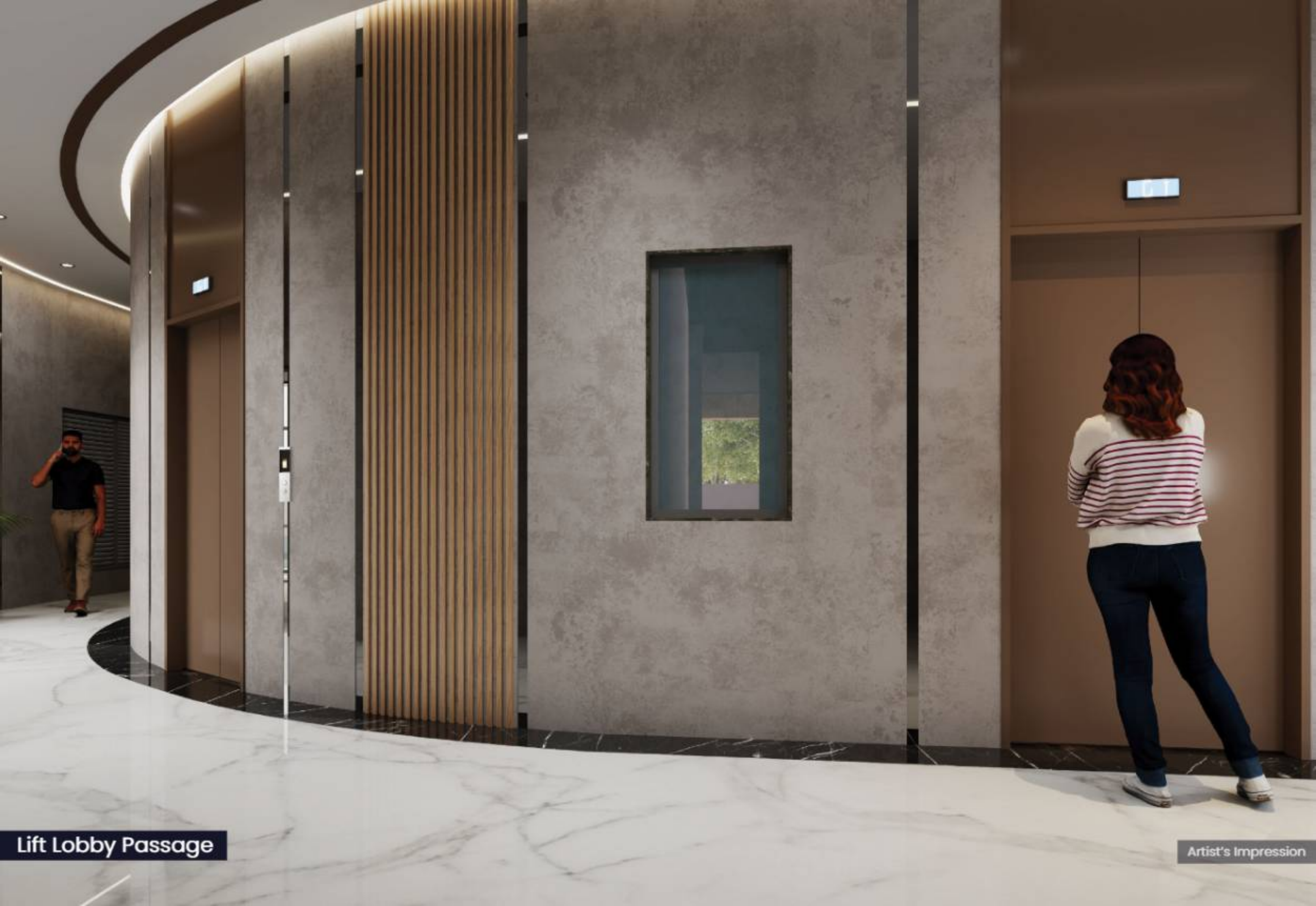
Lift Lobby Passage