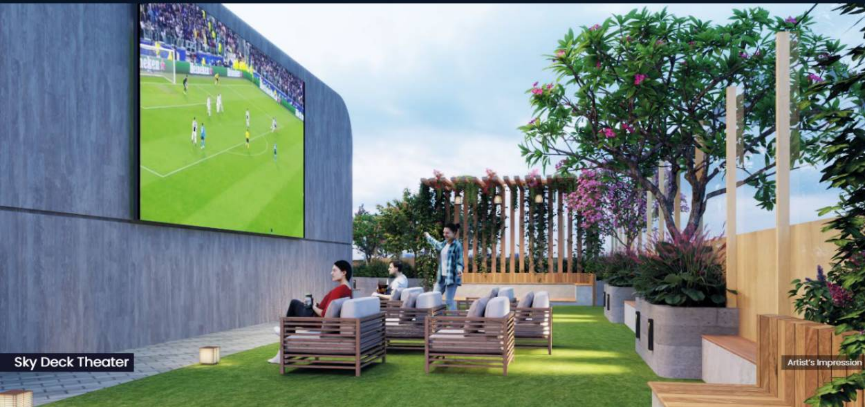
Sky Deck Theater

INDULGE IN Cinema nights BENEATH THE OPEN SKY!