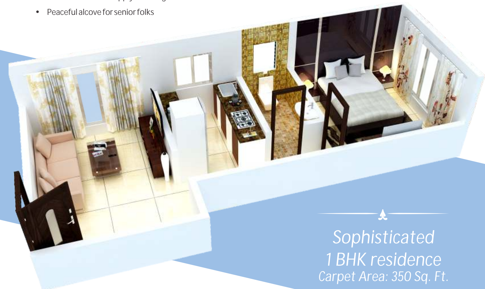
Sophisticated 1 BHK residence Carpet Area: 350 Sq. Ft.