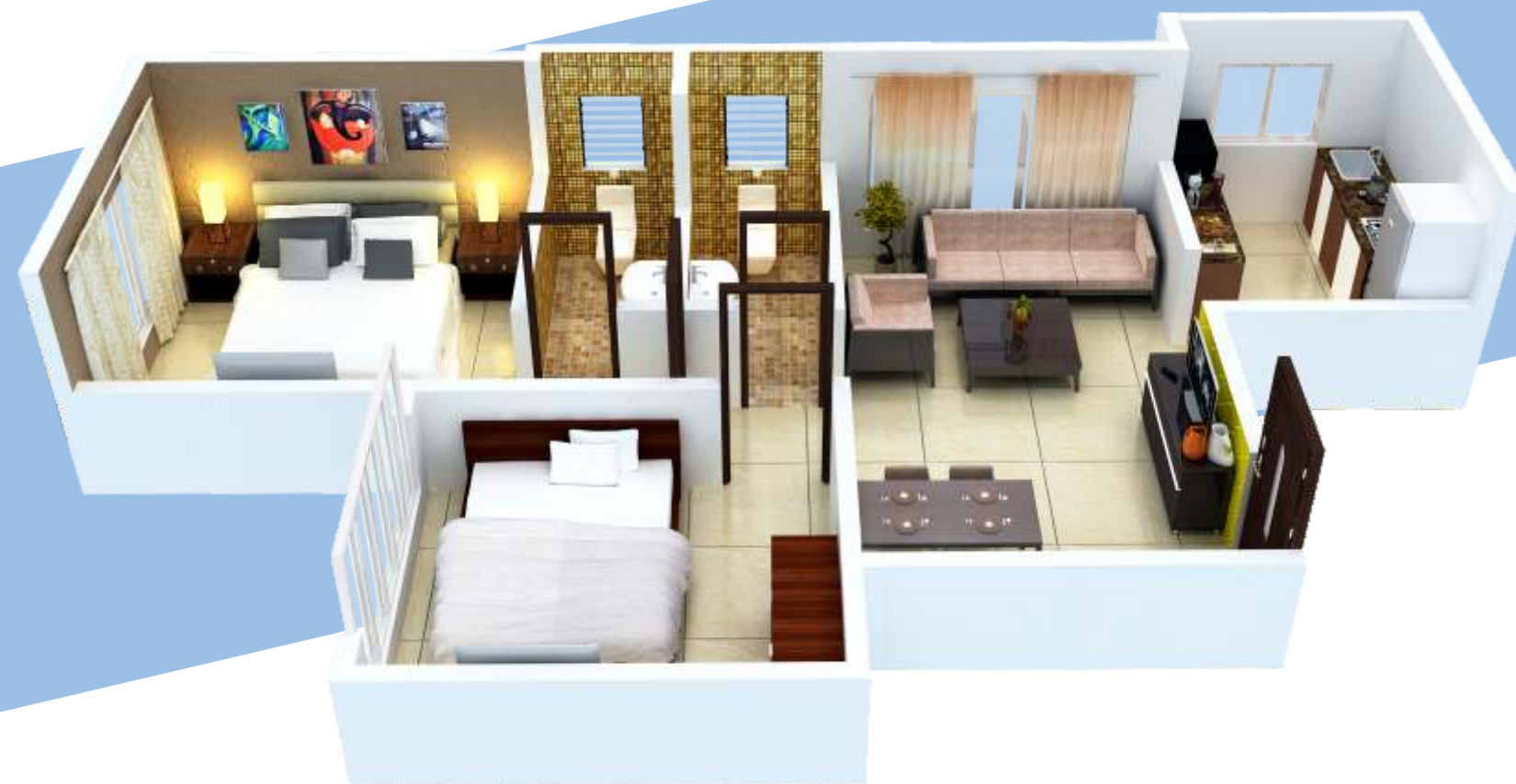
Uber chic 2 BHK Residence Carpet Area: 540 Sq. Ft.